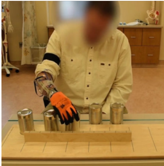
Fig. 1 A subject performing one of the Jebsen Taylor test of Hand Function subtasks

As mentioned above, the Pisa/IIT SoftHand was initially designed as a robotic hand intended for use on humanoid robots. The embodied intelligence of the SoftHand's mechanics suggested it had potential as a prosthetic hand that would not require complex control input from the user. In order to test this theory, it first had to be modified to be more suitable for prosthetic applications. In particular, the overall size of the hand was reduced to better approximate a large male hand. Further, the electronics were reduced in size, modified to interface with commercial electrodes (Otto Bock, Germany), and moved to the back of the hand to create a more compact design. To better interface with a prosthetic socket, a quick disconnect style wrist component was developed that allowed manual pronation and supination; further, the wrist was flexibly connected to the SoftHand Pro to allow passive wrist flexion and extension. Finally, a smaller and lower voltage motor was incorporated to allow use of a smaller, lighter-weight battery. For each subject, a custom prosthetic socket was built by a certified prosthetist.